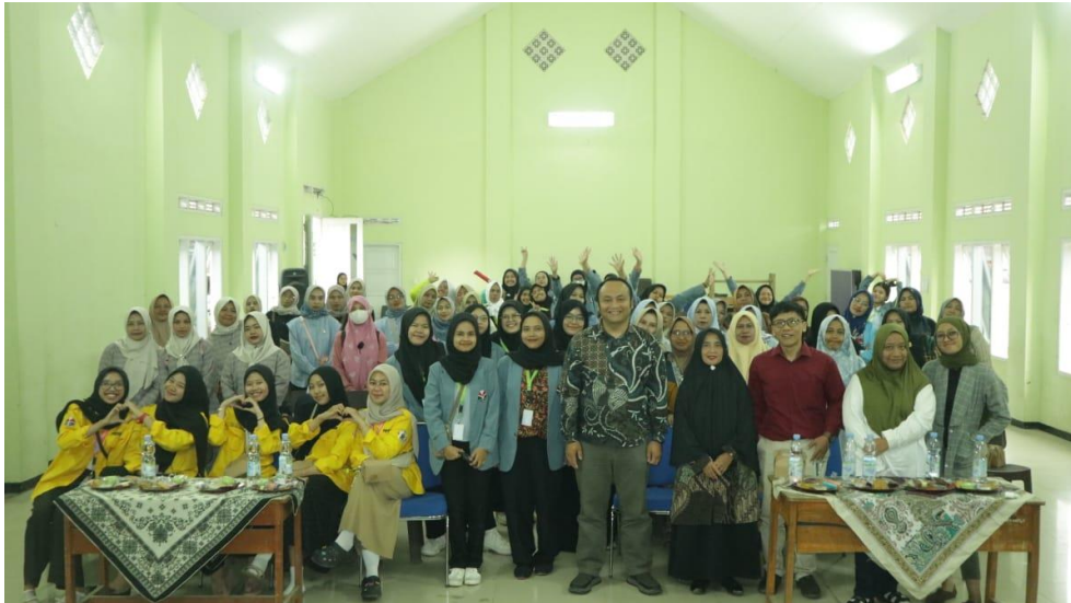
Figure 2. Stunting Prevention Seminar Activities

Both hope that a similar workshop can be held again, with additional topics such as how to effectively process vegetables so that children like them, considering that many children in the Pangalengan area find it difficult to eat vegetables even though this community is a vegetable producer. In addition, the first speaker emphasized the importance of expanding this education to reach more people, especially because of the high rate of early marriage in Pangalengan. Further education is expected to increase public understanding of the importance of parenting in preventing stunting and creating a healthier generation in the future.