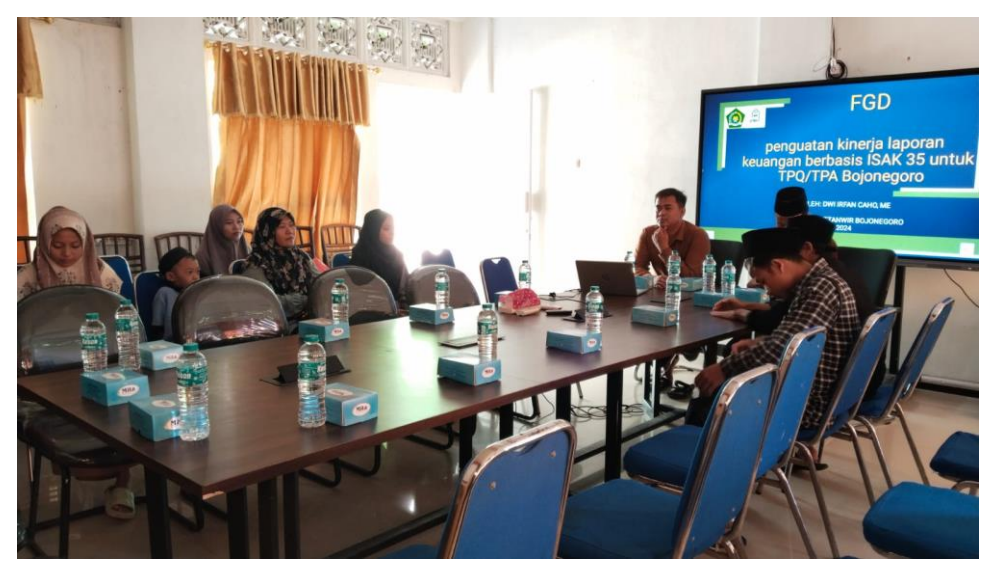
Figure 2. Chairman of Community Service conducts FGD

The results of the Focus Group Discussion (FGD) held on November 25, 2024 at the auditorium of the At-tanwir Institute Bojonegoro resulted in priority programs explained in table 1.