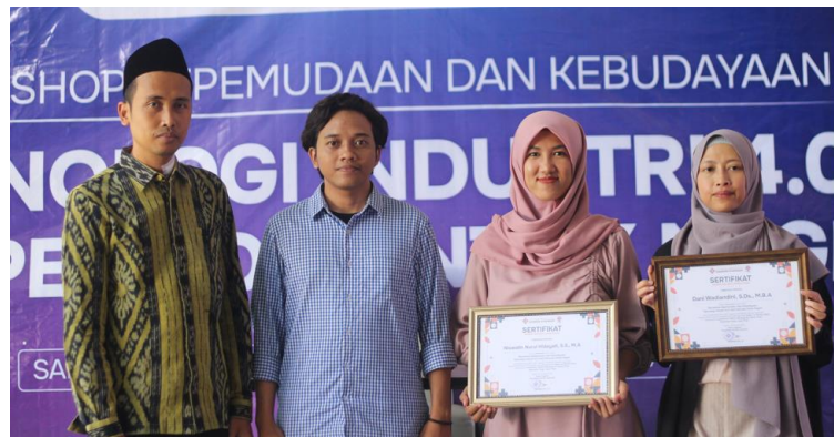
Picture 3. Workshop Activities About Social Media

Ethics in social media usage involves adhering to responsible conduct, respecting privacy, promoting honesty, and maintaining integrity in online interactions. Here are key aspects of ethical considerations in using social media. Privacy and Consent: Respecting individuals' privacy rights is crucial. Users should obtain consent before sharing personal information, photos, or videos of others. Respecting privacy settings and refraining from sharing sensitive information without permission is imperative. Authenticity and Truthfulness: Upholding honesty and authenticity is fundamental. Misrepresentation, spreading false information, or engaging in deceitful practices negatively impact trust. Users should strive to share accurate, reliable content and refrain from creating or spreading misinformation or fake news. Respectful and Inclusive Communication: Social media should be a platform for respectful dialogue and inclusive interactions. Avoiding offensive language, hate speech, bullying, and discrimination contributes to a safer and more inclusive online environment. Credible Sourcing and Attribution: When sharing content, crediting and acknowledging original sources is essential. Users should give credit where it's due, respect copyrights, and avoid plagiarism or intellectual property infringement.