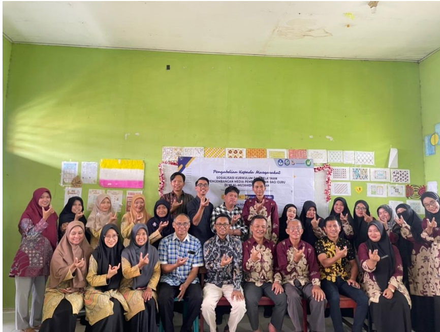
Figure 3. Conclusion of The Mentoring