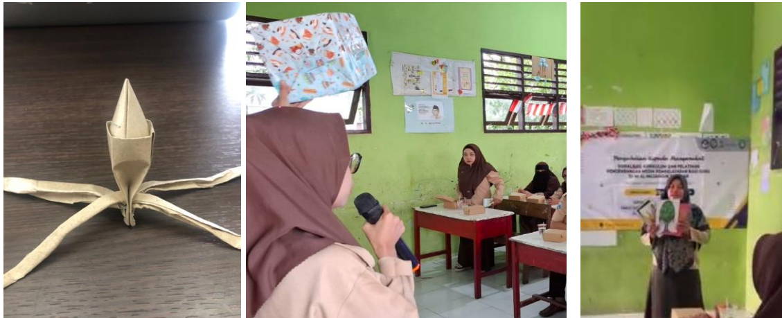
Figure 4. Media Dissemination: a) Example of Virus Model; b) Geometric Shape Media; c) Poster Media

for discussion. Therefore, the poster's role here was not only as an informative medium but also as a catalyst for student interest, balancing information with a harmonious visual element.