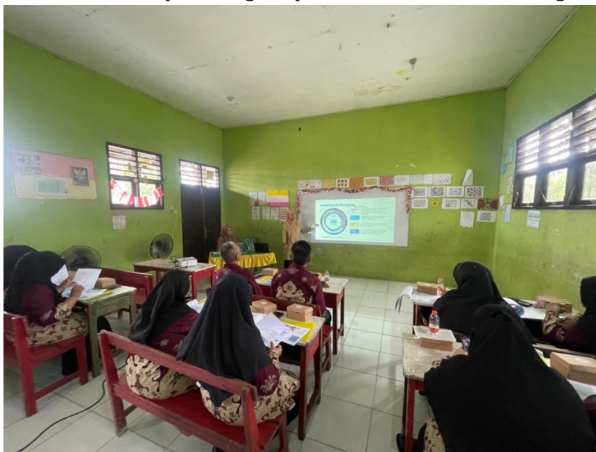
Figure 2. Learning Media Outreach and Mentoring

The primary focus of outreach and mentoring activities for creating learning media is to provide teachers with an overview of the available types of learning media. The outreach begins with an introduction to learning media types, including realia (real objects), visual media, audio media, audiovisual media, and multimedia, as shown in Figure 2. Furthermore, this section explains how to use these media in learning contexts, such as gamification and game-based learning. In this outreach, the community service team also outlines how to integrate media into the Indonesian curriculum, emphasizing deep and differentiated learning.